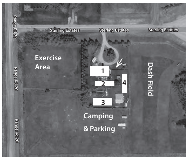
Map of event layout.