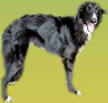
Secret Haven's Chipndale